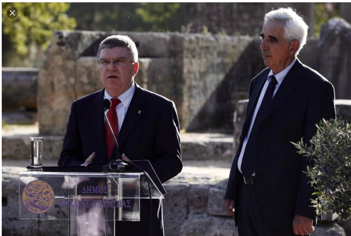
The President of the IOC, Tomas Bach, and the Mayor of Ancient Olympia, sign the Declaration of the Olympic Truce, in front of the temple of Hera, on the 20 th April 2016.