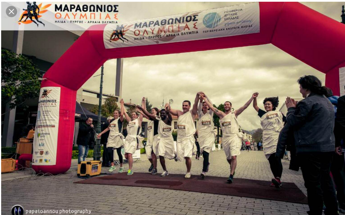
Students of the Master's Degree Programme, "Olympic Studies, Olympic Education, Organization and Management of Olympic Events" finish the 1 st Marathon Race of Olympia, March 2015.