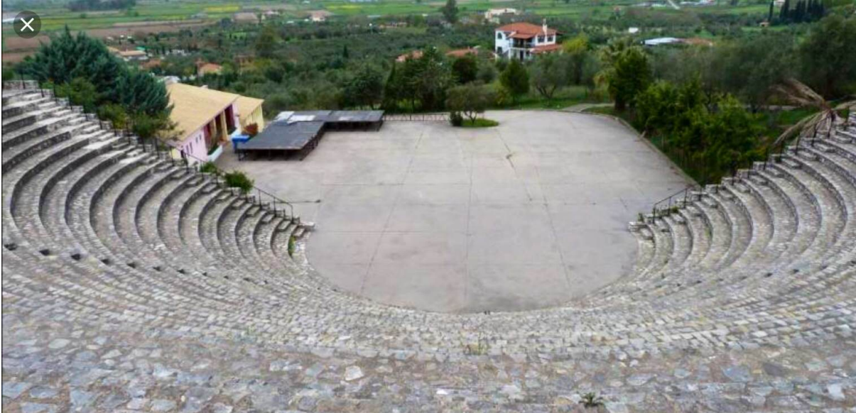
The open air Theatre Floka, in Ancient Olympia, where every summer numerous of musical and theatrical performances take place.