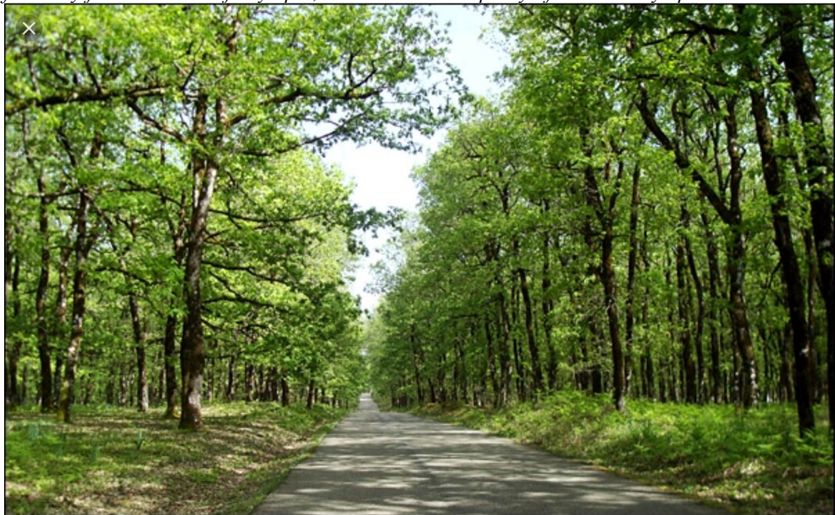
The Oak Forest of Pholoe (Foloi), 5 km far away from Ancient Olympia.