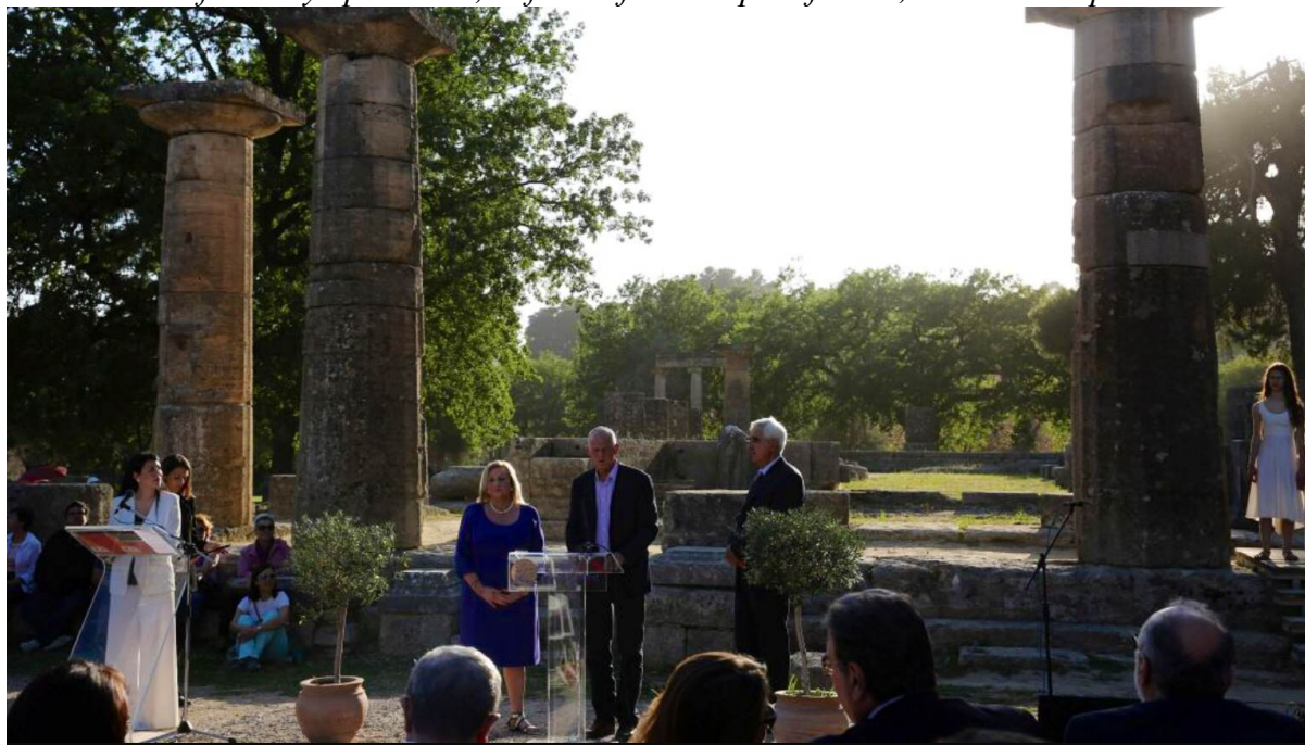
The Ex Prime Minister of Greece and Vice President of the International Olympic Truce Centre (IOTC), Georgios Papandreou with the Vice President of the IOTC, as well, Fani Palli Petralia, sign the Declaration of the Olympic Truce.