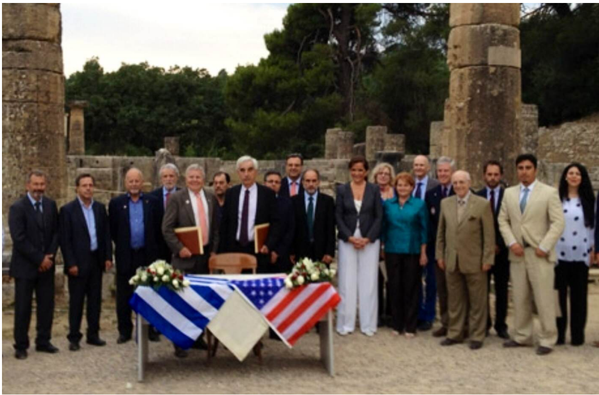
Sister-Cities Agreement between Ancient Olympia and Colorado Springs, in front of the Temple of Hera, June 2014.