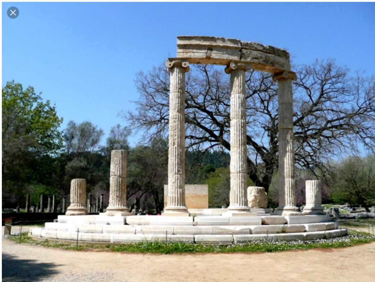
The Philippeion (Greek: Φιλιππεῖον) in the Altis of Olympia was an Ionic circular memorial in limestone and marble, which contained chryselephantine (ivory and gold) statues of Philip's family; himself, Alexander the Great, Olympias, Amyntas III and Eurydice I.