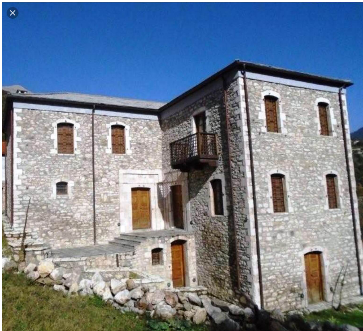
The culture and environmental information centre of Divri, ‘the Petralia Mansion’, 50 km far away from the town of Olympia, within the Municipality of Ancient Olympia.