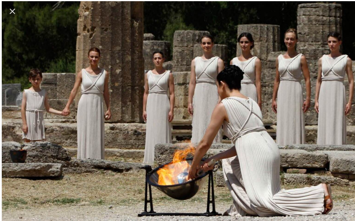
The Olympic Flame is alight for the very first time by the Greek sun at the sacred and historic site of Ancient Olympia. The ritual of the Lighting, in simplicity and mystagogy, starts with the procession of the priestesses from the Altar of Hera, in front of the goddess's temple. Dressed in archaic-style clothing, priestesses surround the Altar while the High-priestess, invoking god Apollo, lights