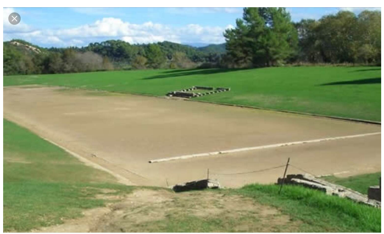
The stadium at the archaeological site of Ancient Olympia, is located to the east of the sanctuary of Zeus. It was the location of many of the sporting events at the Ancient Olympic Games.

The selected photos being presented below are the most characteristic ones, are those which demonstrate and encapsulate what Ancient Olympia is and symbolizes; ancient history, modern history, Olympism, natural environment, important cultural and athletic events.