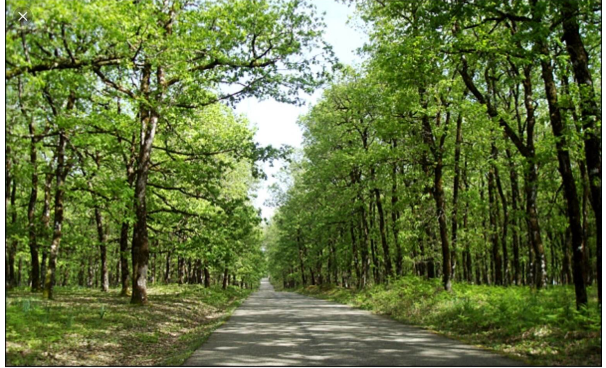
The Oak Forest of Pholoe (Foloi, 5 km far away from Ancient Olympia.

The culture and environmental information centre of Divri, 'the Petralia Mansion', 50 km far away from the town of Olympia, within the Municipality of Ancient Olympia.