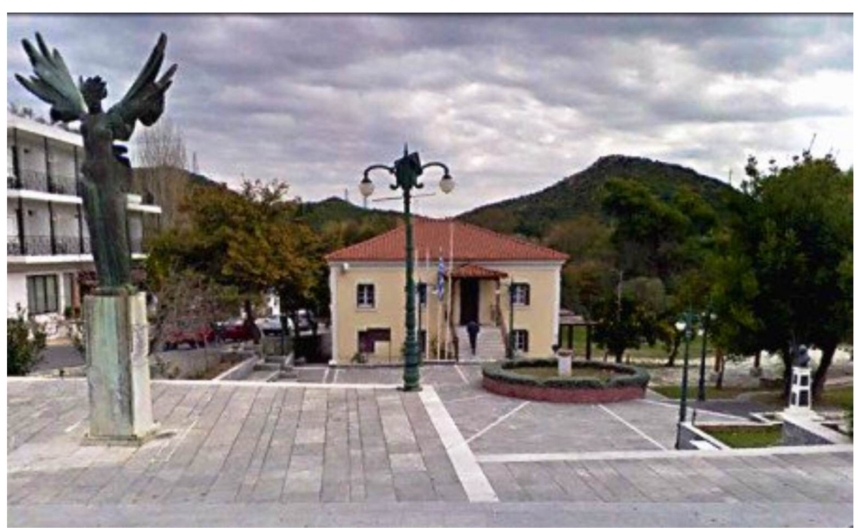
The old Town-Hall of Ancient Olympia, which hosts in its quadrangle many cultural events and where monuments donated by Municipality's sister-cities are located.