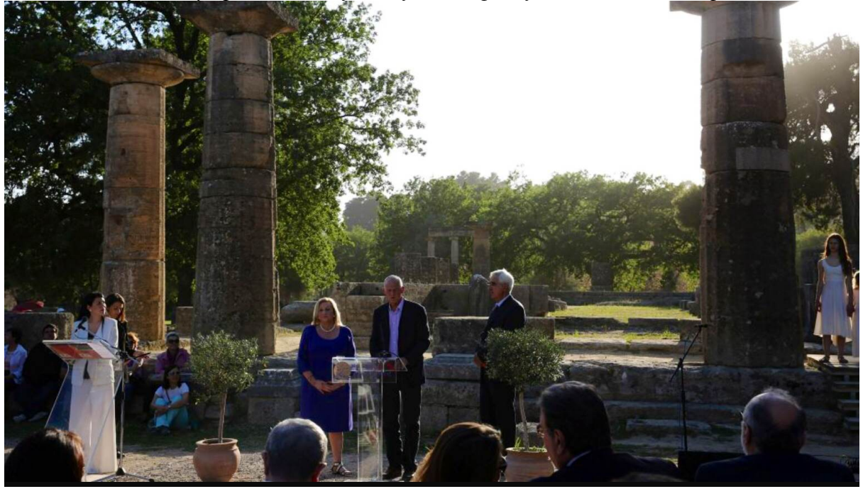
The Ex Prime Minister of Greece and Vice President of the International Olympic Truce Centre (IOTC), Georgios Papandreou with the Vice President of the IOTC, as well, Fani Palli Petralia, sign the Declaration of the Olympic Truce.