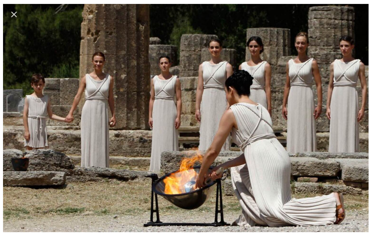
The Olympic Flame is alight for the very first time by the Greek sun at the sacred and historic site of Ancient Olympia.

The ritual of the Lighting, in simplicity and mystagogy, starts with the procession of the priestesses from the Altar of Hera, in front of the goddess's temple. Dressed in archaic-style clothing, priestesses surround the Altar while the High-priestess, invoking god Apollo, lights