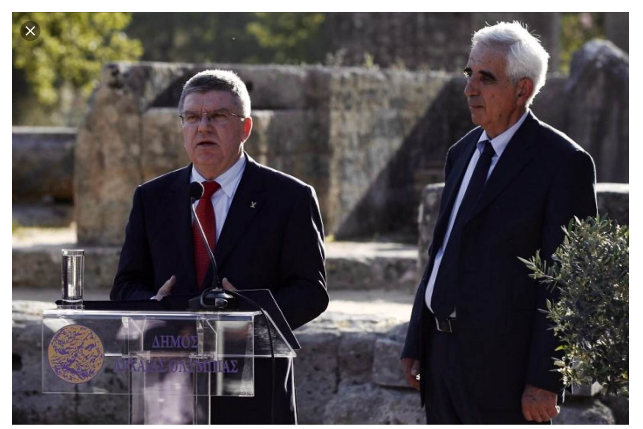
The President of the IOC, Tomas Bach, and the Mayor of Ancient Olympia, sign the Declaration of the Olympic Truce, in front of the temple of Hera, on the 20<sup>th</sup> April 2016.