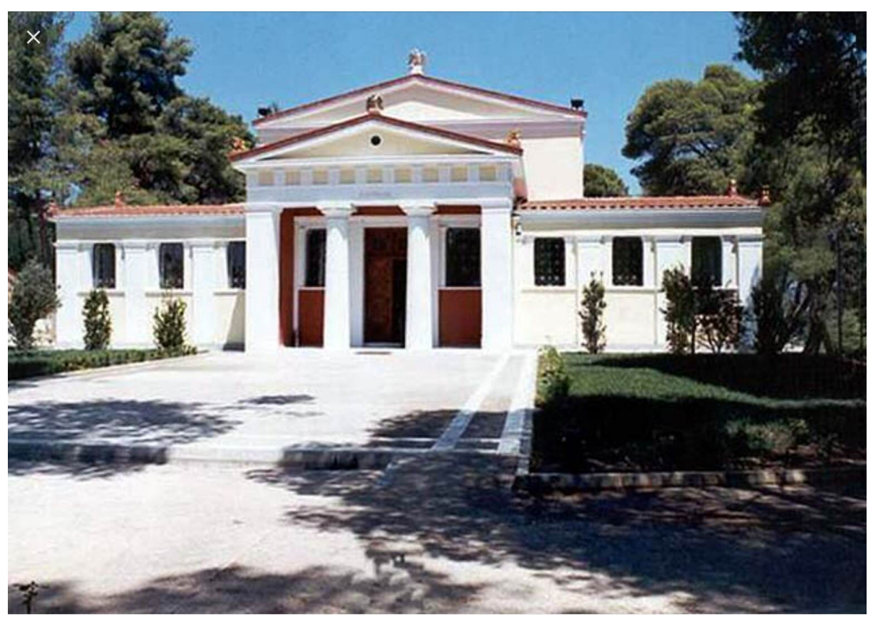
The Museum of the History of the Olympic Games in Olympia: The first archaeological museum of Olympia was established in 1886 on top of a small hill, western of Alteos area. After a series of damages caused by an earthquake in 1954, the archaeological museum was rebuilt and in 2004 it was officially turned into the Museum of the History of the Olympic Games.

the torch, using a concave mirror. According to the Myth of Promytheus, the fire is the symbol of life, rationalism and freedom as well as inventiveness and so had been the ageless flame that used to burn on the Altar of Prytaneion in Ancient Olympia.