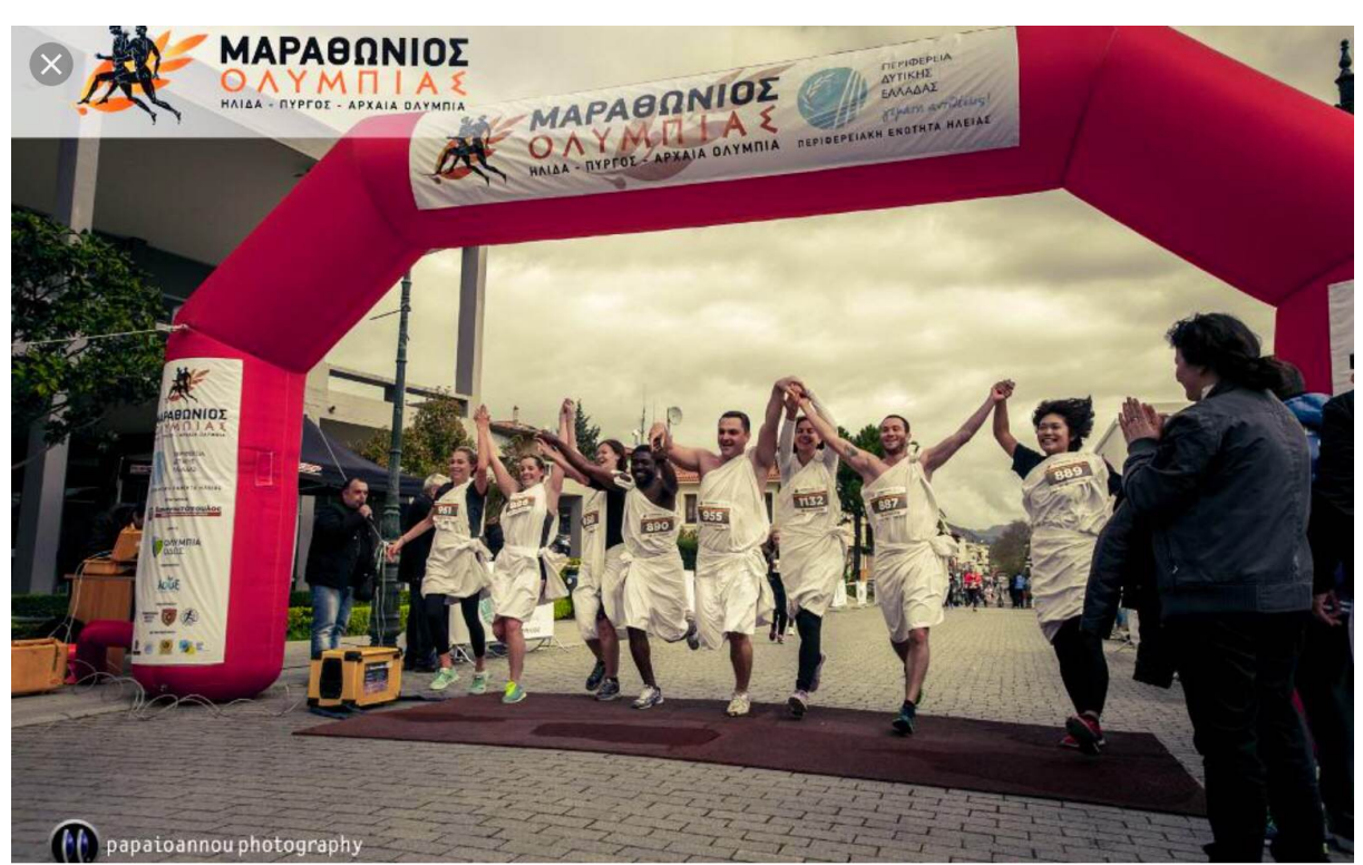
Students of the Master's Degree Programme, ''Olympic Studies, Olympic Education, Organization and Management of Olympic Events'' finish the 1<sup>st</sup> Marathon Race of Olympia, March 2015.