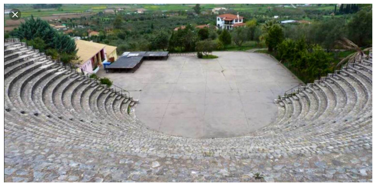
The open air Theatre Floka, in Ancient Olympia, where every summer numerous of musical and theatrical performances take place.