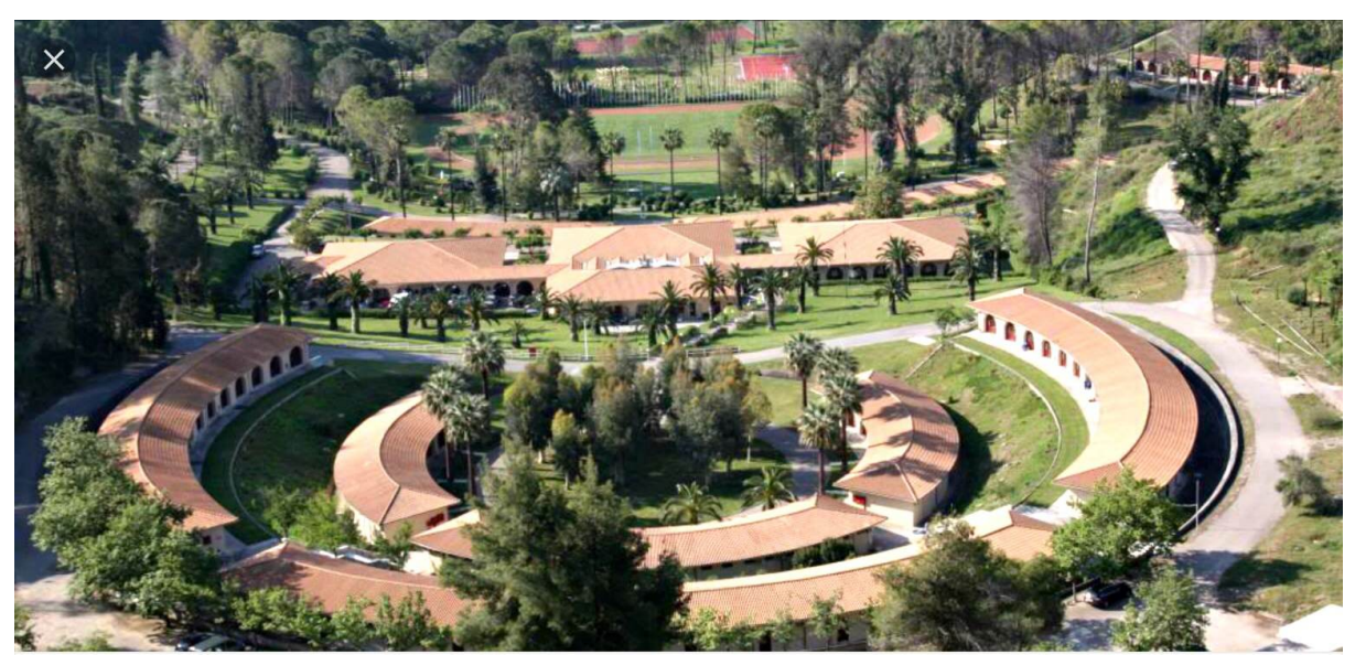
The IOA premises are next to the Ancient Olympia archaeological site, where the Olympic Games and the idea and the philosophy of life of Olympism were born and developed, as the Baron Pierre de Coubertin, renovator of the modern Olympic Games, underlined.