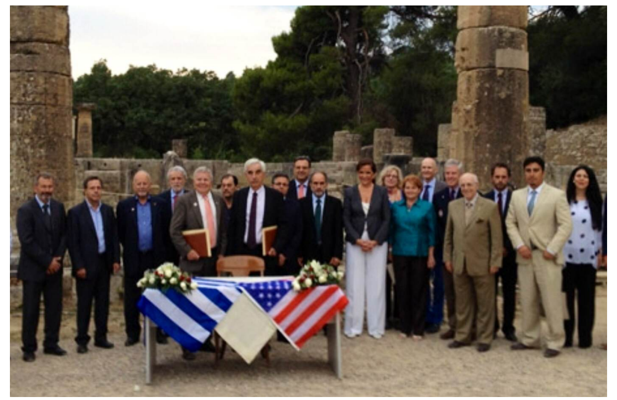
Sister-Cities Agreement between Ancient Olympia and Colorado Springs, in front of the Temple of Hera, June 2014.